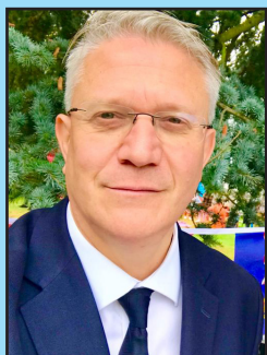
Andrew Rosindell M.P.